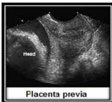
Fig.1. Placenta previa.

The products were resulting from spontaneous pregnant loss in 35 cases