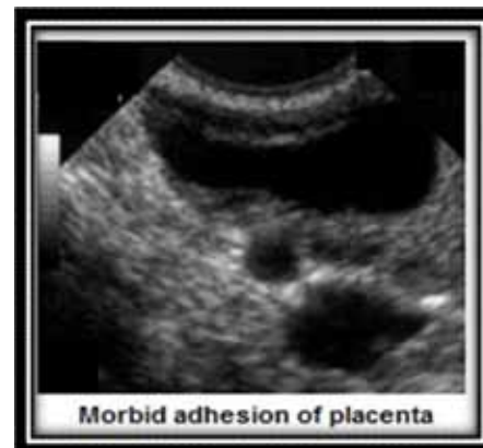
Fig.2. Morbid adhesion of placenta.