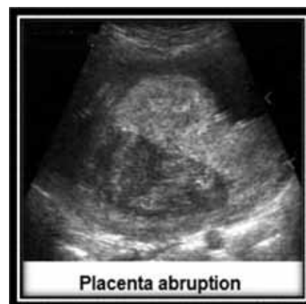
Fig.3. Placenta abruption.