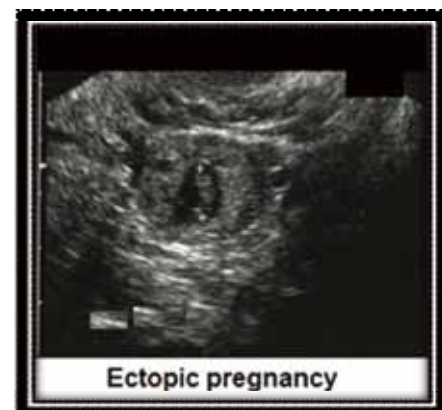
Fig.5. Ectopic pregnancy.