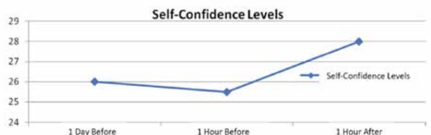
Fig.3. Self-Confidence Levels of Taekwondo Athletes in the Adult Turkish Championship Competitions.